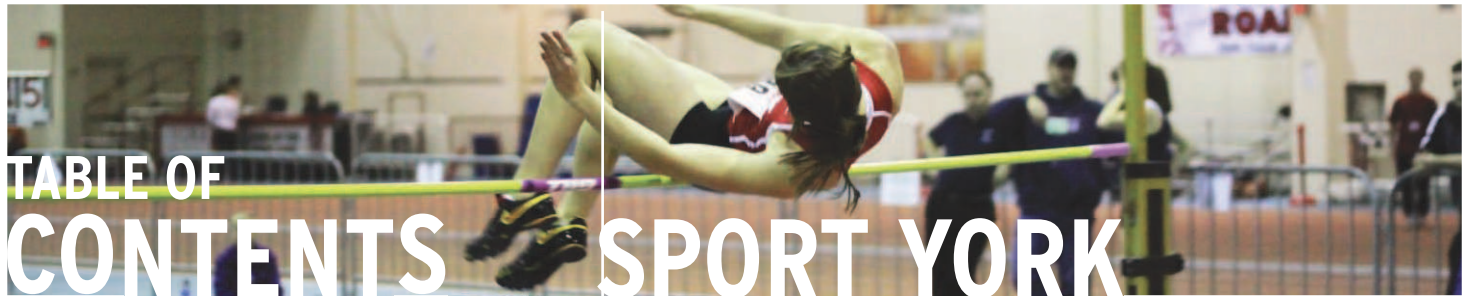
TABLE OF CONTENTS SPORT YORK